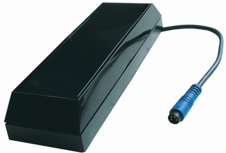
Housing of TPS 100 / 200 / 210