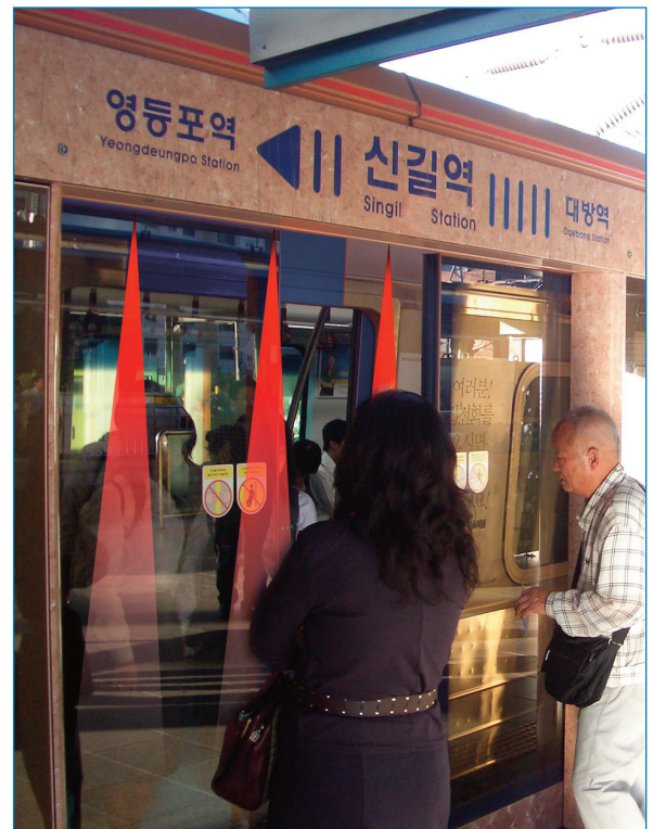
People counting with a TPS 210 in a public transportation application