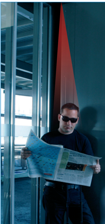
Object detection with the TPS 100